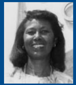
Supervisor Yvonne Brathwaite Burke